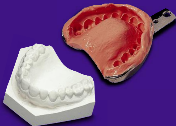
Cavex alginate has a compression strength of 1,0 Mpa (ISO-norm 0,35 Mpa). Therefore you can always remove the impression from the mouth without tearing, even with a large number of undercuts. It can even be poured out twice without any problem.

To comply with your quality requirements at all times and in every situation, we test raw materials and alginates before, during and after production. Look at the test results. And we have been doing this now for 50 years. Precision is one of the reasons for Cavex' worldwide success.